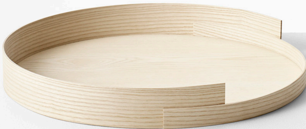
-STACK NO 7 -

STACK Collection is comprised of two moulded trays; No. 5 and No. 7, in ash wood, inspired by the traditional shaker bentwood boxes from the mid-eighteenth century.